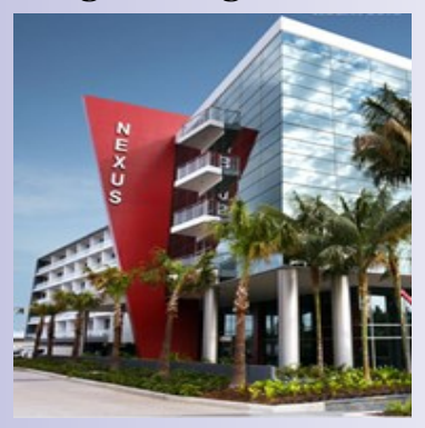
Level 5, Nexus Norwest Bldg, 4 Columbia Court, Baulkham Hills, NSW 2153, Australia.