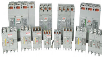
Distribution Board MCCB & ELCB