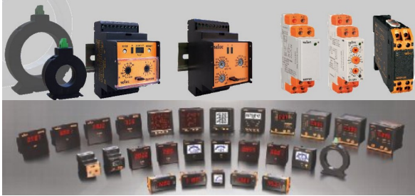
Analog Protection Relay

For Industrial , Domestic and Commercial Applications